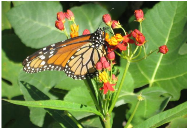
Monarch on Mexican Milkweed (Asclepias curassavica)