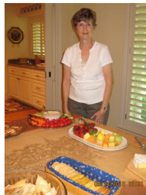
September board meeting

If you are interested in any of these positions, please contact Terri Hurley at 281-491-9609 or thurley001@comcast.net.