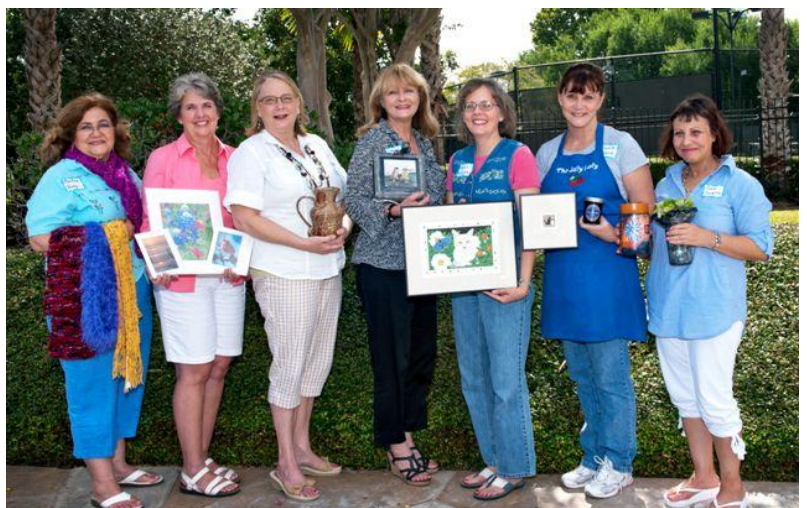
Vendors and their Art.